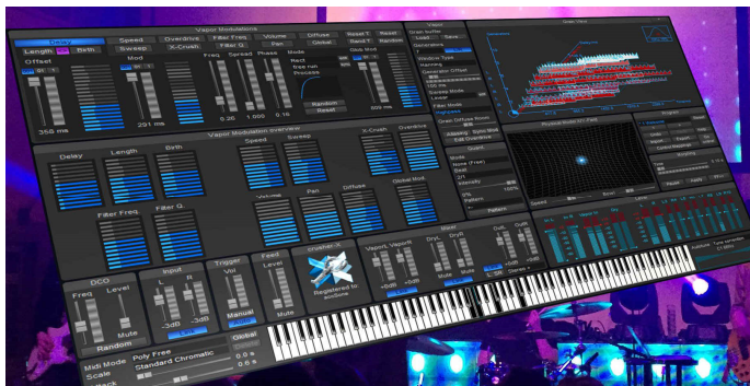
accSone crusher-X 6

accSone developments focuses on software technologies providing sound designers, musicians and video artists with special and unusual tools for their outstanding projects. accSone was founded in 1997 and is located in Munich/Germany. The accSone flagship product crusher-X was born 1999 and raised up to the "most sophisticated" tool for granular synthesis in the market.