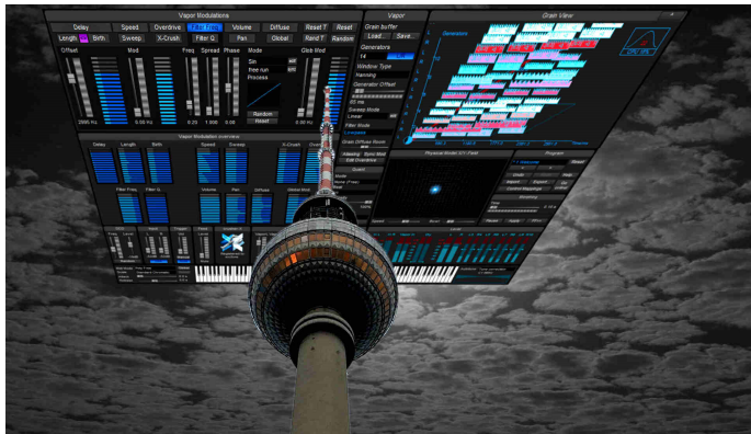
crusher-X 6 arrives at Superbooth 17 in Berlin / Germany (20-22 April 17)